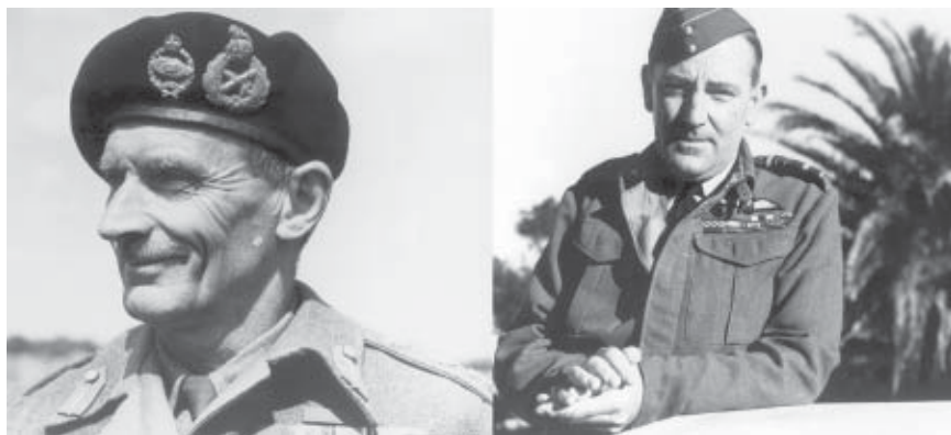
Gen. Bernard Montgomery and Air Vice-Marshal Arthur Coningham: the air-ground team that served as the example for American forces in North Africa

The U.S. experience echoed Montgomery's observations, so the War Department directed that a new doctrine manual be written. The task was given to two airmen and an armor officer, and their product was War Department FM 100-20, "Command and Employment of Air Power," published in July 1943.