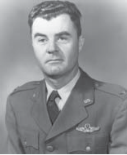
Col. Paul Tibbets, commander of the 509th Bomb Group

Tokyo. There were too few bombs available to waste on empty space. It was also feared that since the actual bomb had not yet been tested—Trinity was a huge, static device tested under laboratory conditions—the psychological and political harm of announcing a demonstration only to have the bomb fail to detonate was too great a risk. This concern was not trivial. Even the head of the Joint Chiefs of Staff, Admiral William Leahy (who fancied himself an ordnance expert), predicted failure. In addition, military