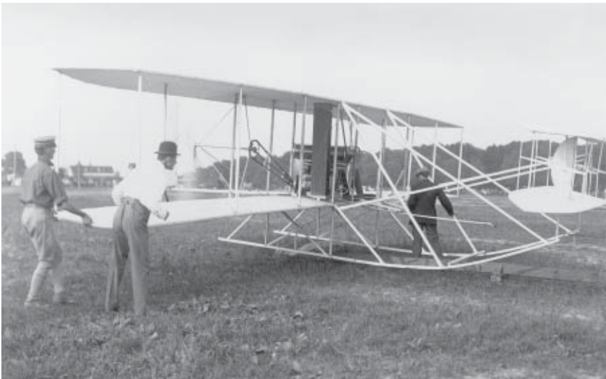
The Wright Brothers with the Military Flyer at Ft. Myer in 1909