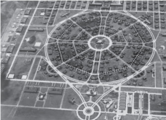
Randolph Field, Texas in 1939, "The West Point of the Air"

Overall, the Air Corps Act was a major stepping stone in the advancement of American airpower. The Army, grudgingly, was forced to show more respect to airmen and allow them to serve in key command and staff positions, but it also increased friction between the new Air Corps and ground officers. The Act also gave airmen more autonomy to plan their own destiny and to begin formulating a doctrine of airpower employment. Finally, the Air Corps Act increased the size of the air arm, while also improving its quality. As the country descended into the Great Depression, these proved to be important considerations. It was not what airmen desired or thought necessary for the country's security, but it was a significant step forward.