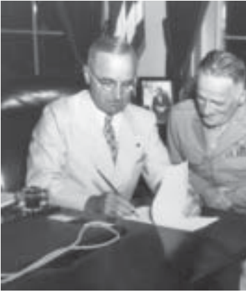
President Truman with Gen. Carl Spaatz

their efforts. And finally, there would be no powerful chairman of the JCS; rather, there would be a Chief of Staff to the President—the position that Adm. Leahy had held during the war. Like the Secretary, this senior officer would merely try to coordinate, not direct. The Navy seemed mollified by this arrangement, especially when the first Secretary of Defense was announced as James Forrestal—then the Navy Secretary.