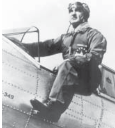
Maj. Gen. Oscar Westover, Chief of the U.S. Army Air Corps, 1935

improved the situation, but was still insufficient—it was not always clear just who was in charge of what. As a result, in