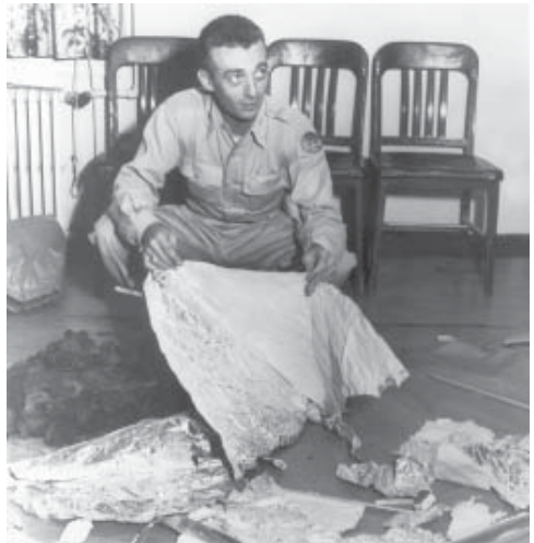
“Weather Balloon” Wreckage after the Roswell Incident, 1947

Nonetheless, just to be prepared, the Air Force had begun a highly classified upper-air sampling program as early as 1947. High flying aircraft and balloons carrying special sensors would periodically test the air, looking for traces of elements that could only occur as the result of an atomic blast. (In July 1947 one of these balloons crashed in Roswell, NM. Because of the highly secret nature of the sampling mission and technology, the Air Force quickly gathered up the pieces of the wreckage and announced that it was merely a “weather balloon.” That story was not believed by most, and ever since Roswell has been hailed by UFO believers as the site of an alien flying saucer crash that was covered up by the Air Force).