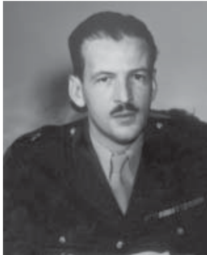
The AWPD-1 Planners: Maj. Harold George, Lt. Col. Ken Walker, Lt. Col. Haywood Hansell and Maj. Laurence S. Kuter