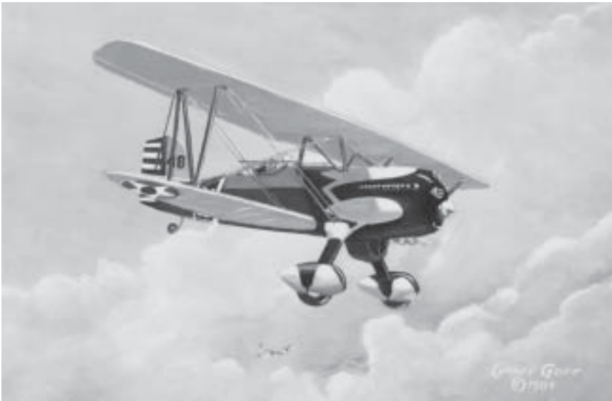
Curtiss P-6E, painting by Luther Gore, Air Force Art Collection

In 1926 the Air Corps had barely 900 officers and 8,750 enlisted personnel. The Act authorized a buildup to 1,650 officers and 15,000 enlisted, while also calling for increased pay for mechanics. As for aircraft, the Air Corps had a total of 1,254 airplanes in 1926; Congress proposed a buildup to 1,800. Such a buildup would cost money. Unfortunately, the funds were never appropriated to fully carry out the Act's provisions due to the economizing tendencies of the Coolidge and Hoover administrations. Moreover, Army leaders were loath to give the money and personnel mandated by Congress. During the