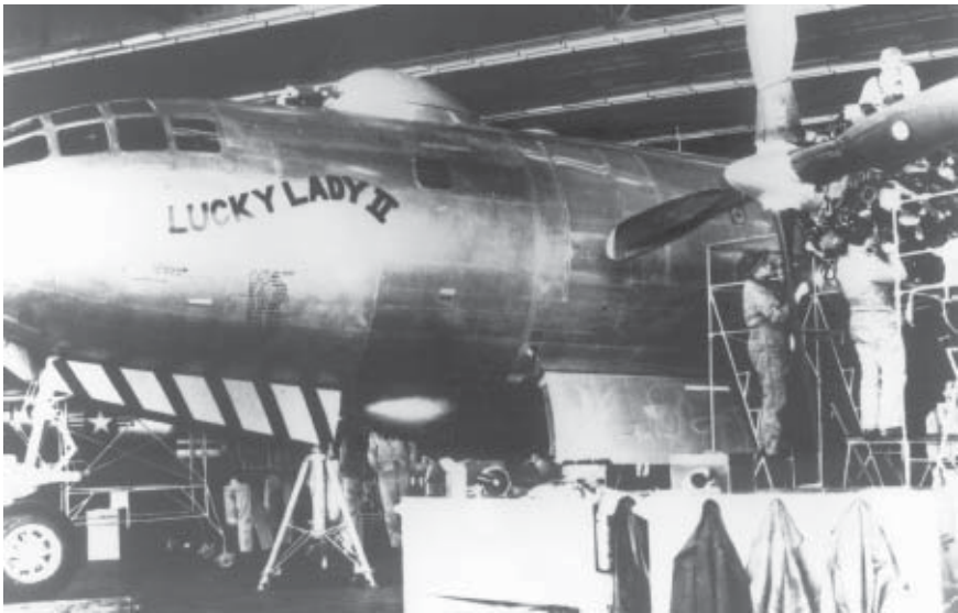
“Lucky Lady II” after its historic flight around the world

By 1949 the Air Force had the answer. In late February, the Air Force planned a mission that involved sending a strategic bomber all the way around the world, non-stop, via air refueling. The bomber was a Boeing B-50—essentially a B-29 on steroids—by the name of “Lucky Lady II.” The refuelers would be modified B-29s, and twelve of them were pre-positioned around the globe. The refueling apparatus used was an adaptation of a British design (the “flying boom” used on current KC-135s had not yet been invented).