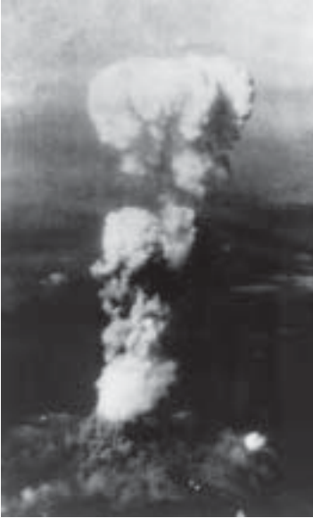
The atomic bomb over Hiroshima

by the sounds of falling buildings and of growing fires, and a great cloud of dust and smoke began to cast a pall of darkness over the city.” Virtually everything within a one-mile radius of the blast was totally destroyed.