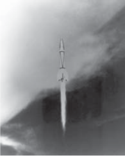
The German V-2 Rocket

were launched by Germany, about 1,100 of which fell on England. The V-2s caused widespread fear among the Allies because the missile impacted with no warning and could not be stopped once launched. It was not until the launching sites were continuously bombed and then overrun by ground forces that the menace was finally eradicated.