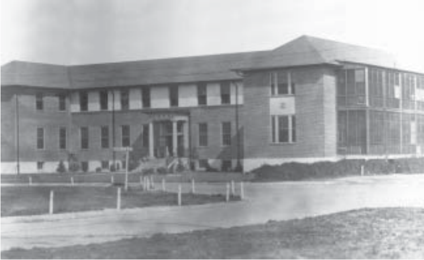
The Air Corps Tactical School at Langley Field, 1930

The airmen realized that in truth, it was not necessary to destroy a nation's entire industrial infrastructure. With each system or network there were key nodes or bottlenecks that bore a disproportionate share of that system's load. In theory, if these nodes were destroyed, the effects would cascade throughout the entire system.