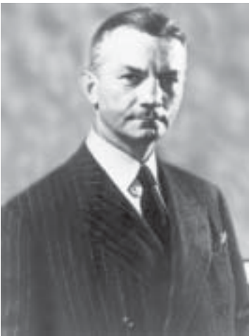
James Forrestal, The First Secretary of Defense

suicide. Several months later the NSA was amended to correct many of the deficiencies that had become so apparent: the service secretaries were downgraded and no longer sat in the President's Cabinet. Instead, the Secretary of Defense was placed over them, and he became the President's chief advisor on military affairs. In addition, a Chairman of the Joint Chiefs of Staff was created who became a statutory advisor to the National Security Council. This basic format has existed ever since—although the chairman has achieved far more authority, especially since the Goldwater-Nichols Act of 1986.