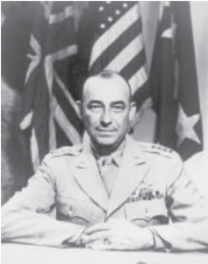
Gen. Joseph T. McNarney

By the middle of 1942, the AAF was placed on a par with the Army Ground Forces and the Army Services Forces. However, because Arnold—whose new title was Commanding General of the AAF—retained his position as Deputy Chief of Staff, he was actually primus inter pares among the three branches. This seniority was highlighted when the Combined Chiefs of Staff (CCS) were formed in 1942 consisting of the heads of the British and American military services. Because the Royal Air Force was a separate service and its head was therefore a member of the CCS, Arnold was designated to sit as the U.S. counterpart, even though he was technically only a deputy. In essence, throughout the war Arnold was treated as an equal of the other chiefs at the grand strategic level of war even though strictly speaking he and the AAF were still subordinate to the Army