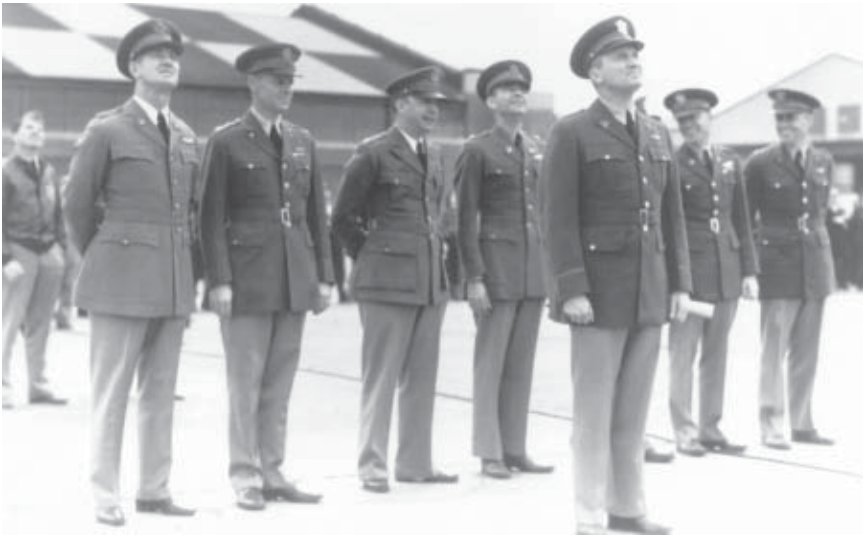
Maj. Gen. Frank Andrews and the GHQ Air Force Staff, 1935

Using such a model, airmen similarly argued for the centralized control of airpower above the corps level. Fuel was added to the fire as a result of yet another commission that met in 1934, headed by the former Secretary of War Newton Baker, to study the issue of American airpower. It agreed with much of the airmen’s thinking regarding centralized control, although it stopped short of advocating a separate service. Army maneuvers in 1931 and 1933 had tested a concept where all the air force assets were centralized under an air commander who reported directly to the theater commander. The results were