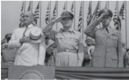
Secretary of Defense Louis Johnson, left

President Truman leaned towards development of the hydrogen bomb, but was concerned that there were dissenters in his administration. He therefore summoned his Secretary of State, Dean Acheson, Secretary of Defense, Louis Johnson, and the Chairman of the Atomic Energy Commission, David Lilienthal to his office in January 1950. Johnson had always been the most hawkish, once stating emphatically: “There is but one nation in the world tonight that would start a war that would