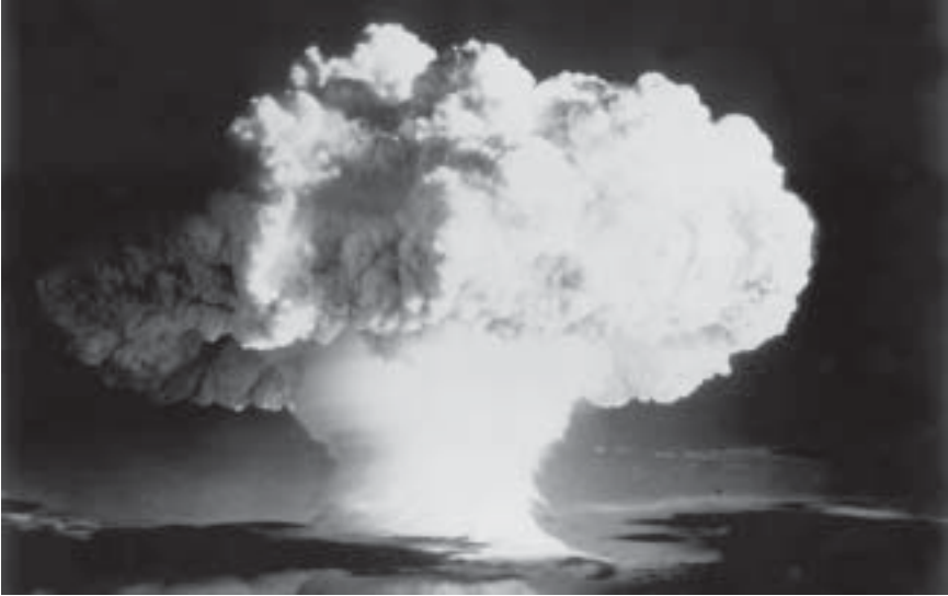
The first hydrogen bomb

in 1945, was essentially a laboratory experiment, not an operational weapon. The first actual hydrogen bomb was detonated on March 1, 1954 with a yield of 14 megatons.