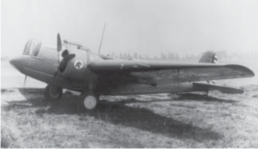
The Martin B-10, the Air Corps' first all-metal, monoplane bomber

Problems still remained. In 1935 the front-line bomber was the Martin B-10. This was an all-metal monoplane with retractable landing gear and enclosed cockpits, a major technological advance over the ungainly biplane bombers it replaced. Unfortunately, it was still not enough. In order to conduct a true strategic bombing campaign the air force needed something far larger with greater range and a greater bomb load. The answer would be the Boeing B-17, which made its maiden flight in 1935, but would not be procured in quantity for another five years.