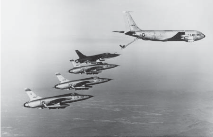
Tanker refuelingan F-105, 1965

blunt. The Air Force could now take off from the U.S. and drop an atomic bomb any place in the world. A clever reporter then asked if air refueling could also be used to extend the range of escort fighters as well. LeMay said there was no reason why not.