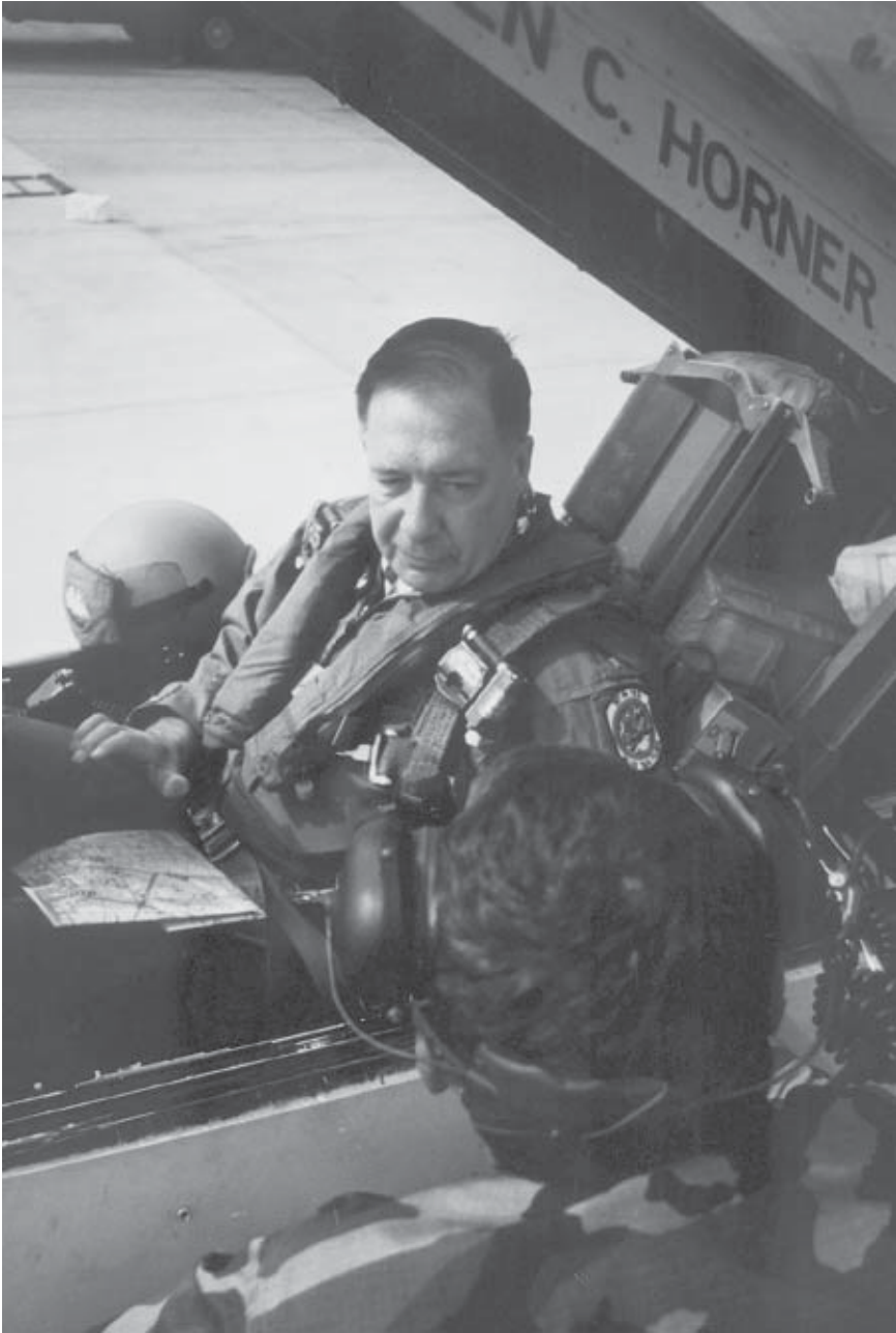
Gen. Charles Horner—JFACC in Desert Storm