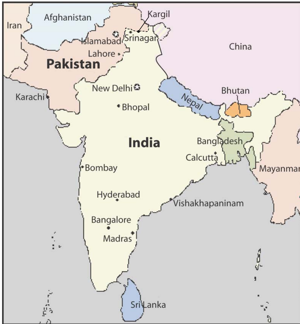
Figure 2. Map of South Asia

Adapted by CRS from Magellan Geographix. Boundary representations not authoritative.