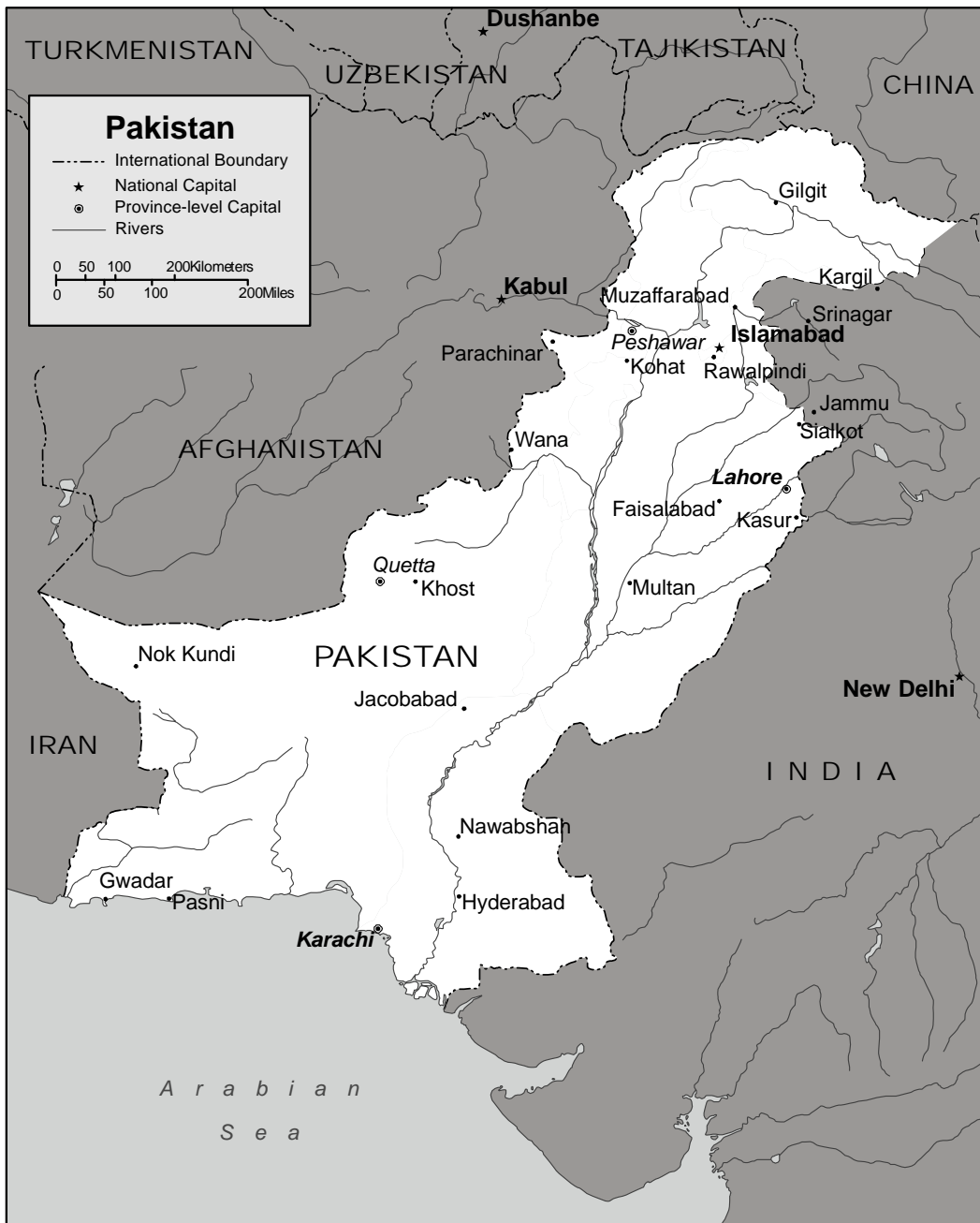
Figure 3. Map of Pakistan