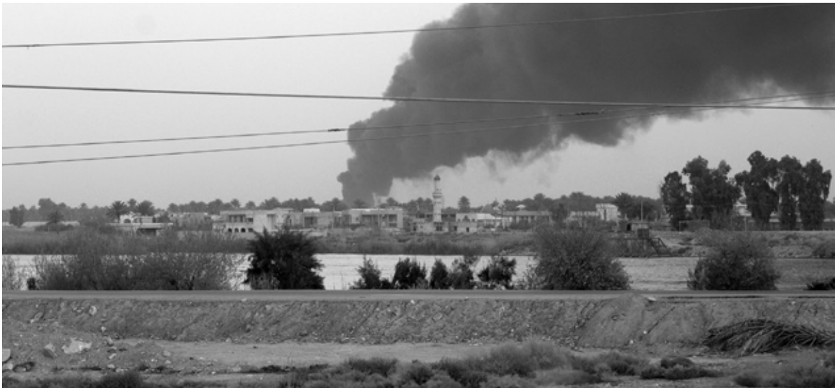
A smoke plume caused by a terrorist attack at the government center in downtown Ramadi, Iraq, 13 March 2006.

In late 2005, the Sunni tribes around Ramadi attempted to expel Al-Qaeda in Iraq (AQIZ) after growing weary of the terrorist group's heavy-handed, indiscriminate murder and intimidation campaign. 3 A group calling itself the Al Anbar People's Council formed from a coalition of local Sunni sheiks and Sunni nationalist groups. The council intended to conduct an organized resistance against both coalition forces and Al-Qaeda elements, but, undermanned and hamstrung by tribal vendettas, it lacked strength and cohesion. A series of tribal leader assassinations ultimately brought down the group, which ceased to exist by February 2006. This