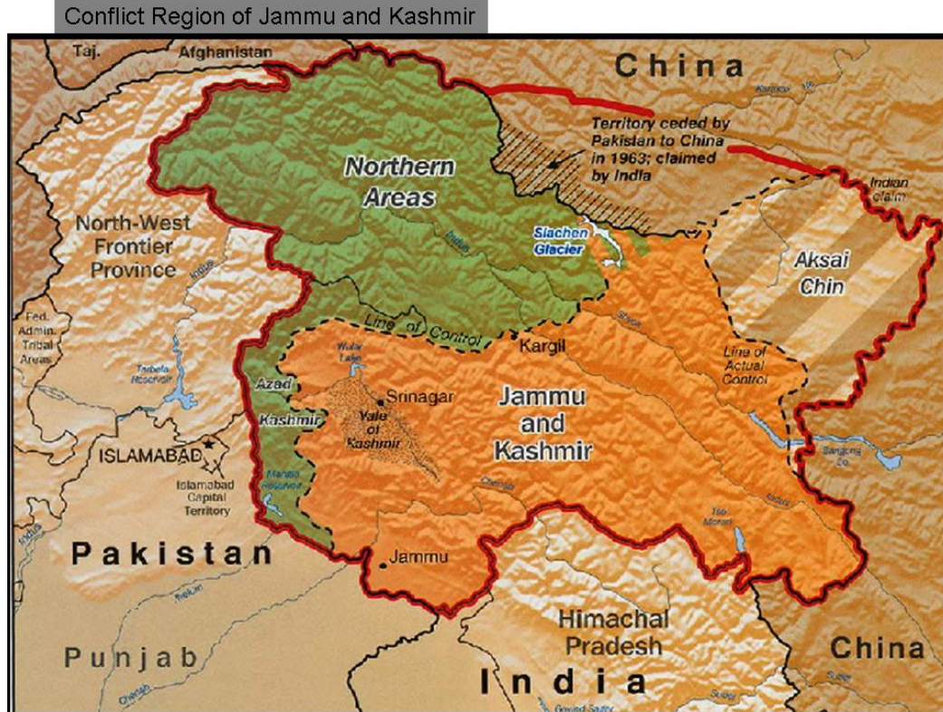
Figure 3 Map of Jammu and Kashmir 84

China, and India illustrated in Figure 3: