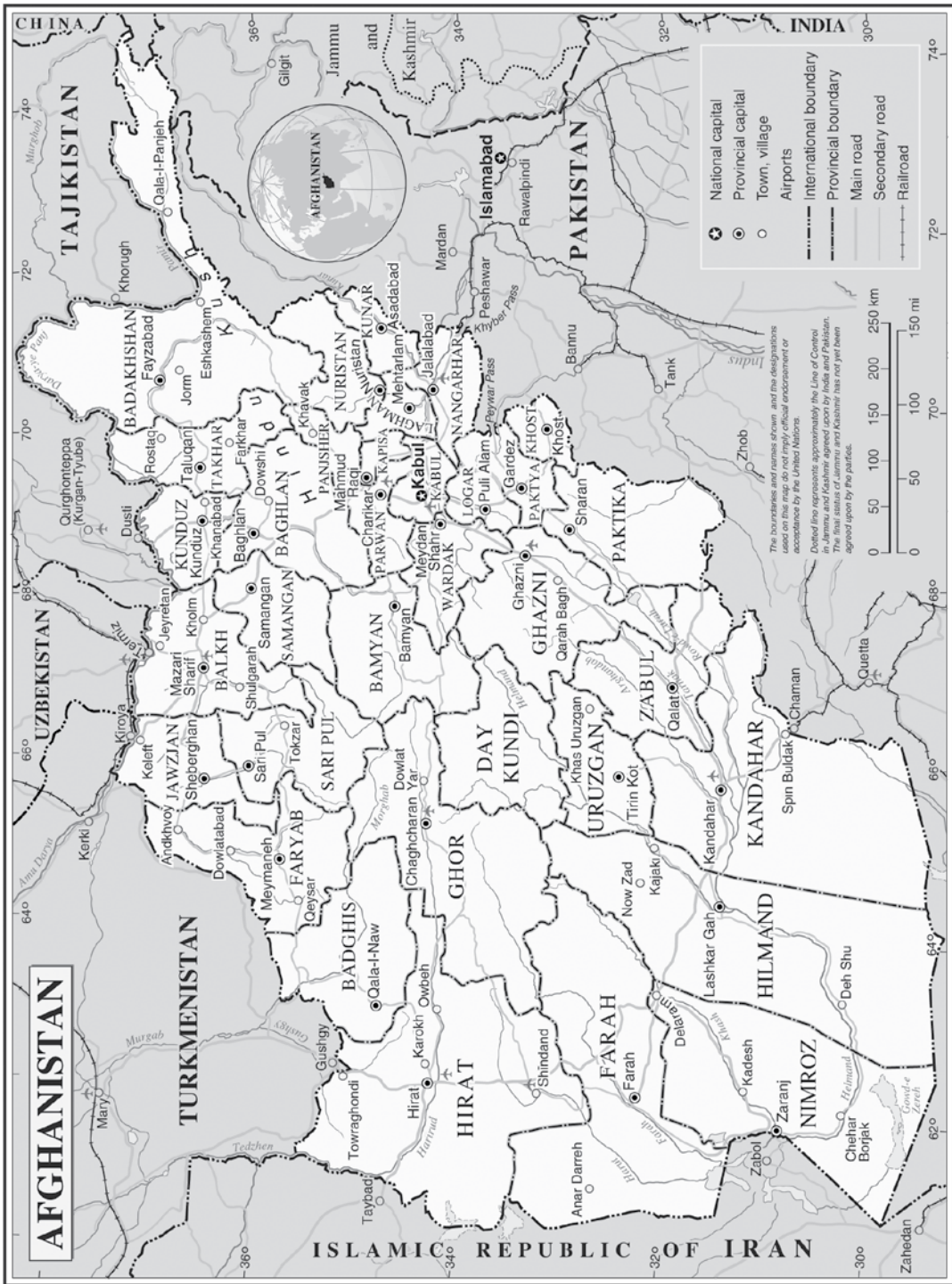
Map 1. Afghanistan.