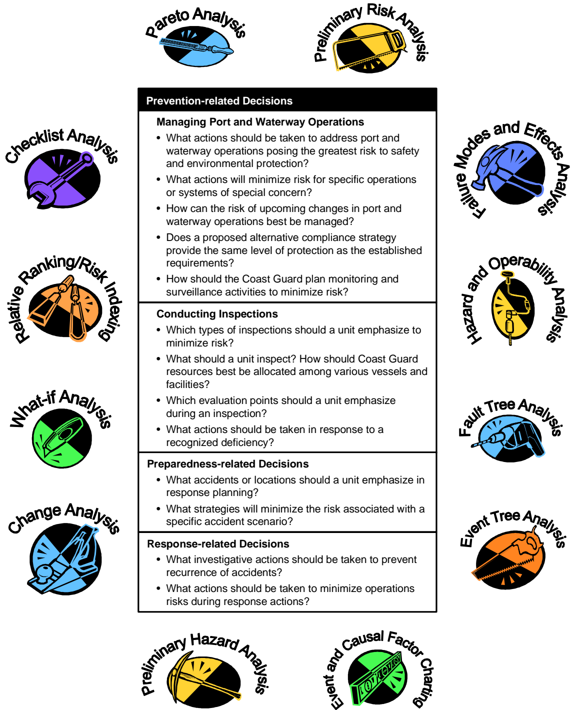
Figure 3 – Decision Situations and Tools Included in the Guidelines