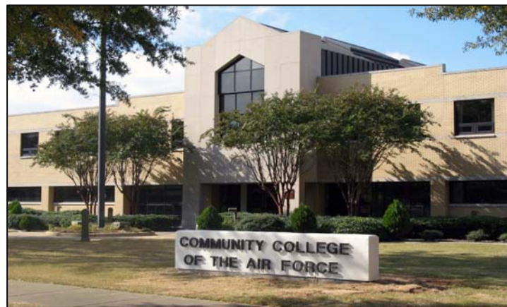
Ryan Hall, CCAF Administrative Center Maxwell-Gunter AFB, Alabama

The administrative staff, located at Maxwell-Gunter AFB, Alabama, brings together all elements of the system under the matrix authority of Air Force Instruction 36-2304, Community College of the Air Force . The Community College of the Air Force was located at Randolph AFB, Texas, during 1 April 1972-15 January 1977; at Lackland AFB, Texas, during 16 January 1977-31 March 1979; at Maxwell AFB, Alabama, during 1 April 1979 – 4 November 2008; at Maxwell-Gunter AFB, Alabama, since 5 November 2008.